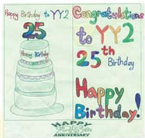
1E Yuen Wing Shan, Coei