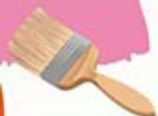
2E Leung Kam Ping