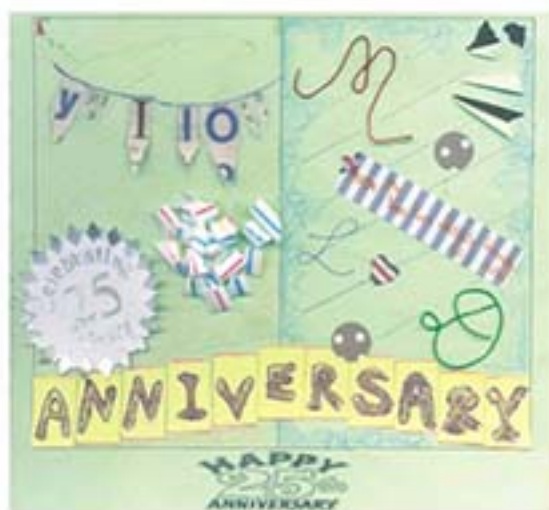
1B So Wing Chi